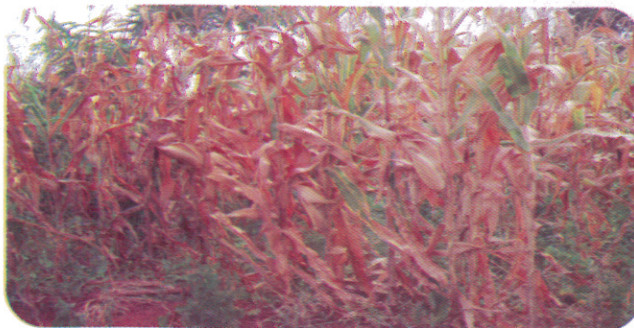
Figure 3 One of Maize fields in Malawi

DONATA is centred on the ideology of innovative Platforms for Technology Adoption (IPTA). An IPTA is a combination of stakeholders that are actively involved in a given value chain. Therefore an IPTA would comprise several actors from breeders, seed multipliers, farmers, transporters, processors etc. The concept of an IPTA in DONATA involves bringing these stakeholders of a given value chain together in a bid to foster mutually beneficial and sustainable business relationships.