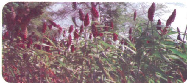
Figure 2 One of the Sorghum fields in Malawi

The decisions are dependent on the local administrative and technical circumstances. Table 1 below shows the number of IPTAs established in each participating SADC country.