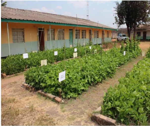
Advancing of more than 65 F3s families during the off season at Misamfu Research Station