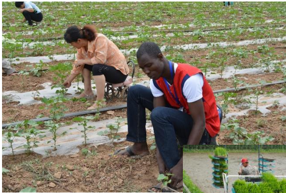
Use of biodegradable plastic mulch +IPM in cotton