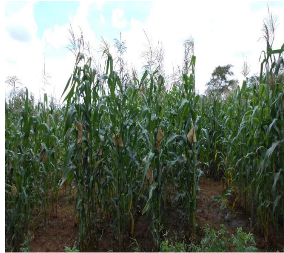
Maize germplasm planted in unreplicated plots at Mt Makulu