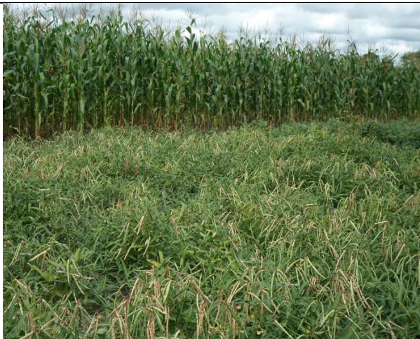
Demonstration on maize-cowpea rotation in Kangomba-Kabwe