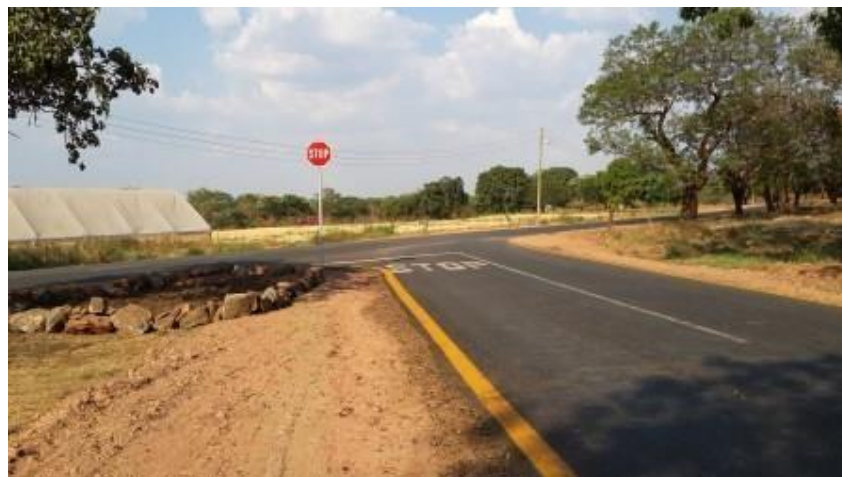
Figure 2 Part of the rehabilitated road at Mt. Makulu