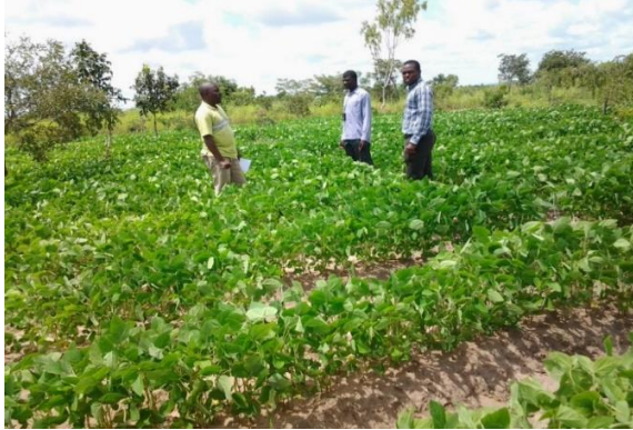
Evaluation of commercial varieties & accessions for water use efficiency at Kasinthula