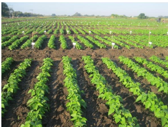
Legume drought tolerance nurseries at Chokwe

Implementation of field activities for most projects commenced at the beginning of the 2014/15 cropping season. By the end of the reporting period, establishment of field trials was in progress. Field assessments for environmental and social safeguards were initiated, but not completed. The RCoL still requires support from the World Bank regarding training in safeguards issues.