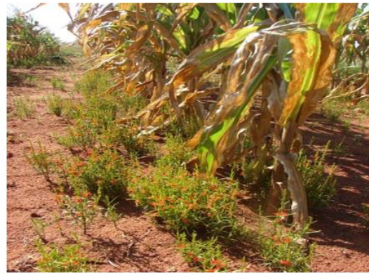
Farmer training on good agricultural practices by DARS staff at Nazolo Irrigation Scheme