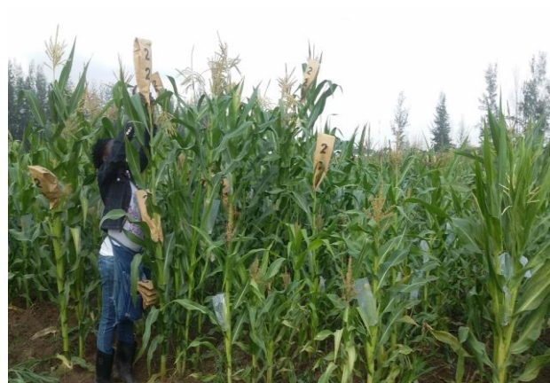
QPM seed multiplication nursery at Umbeluzi