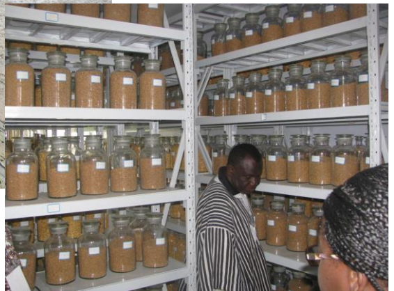
Germplasm storage of maize and wheat seeds in vacuum jars