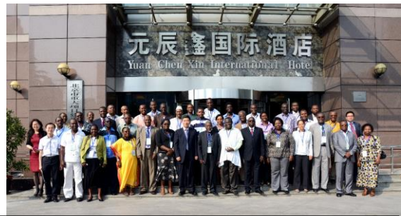
Participants from the 3 APPs in Africa