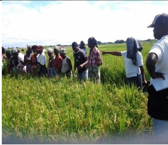
Participatory evaluation of rice varieties