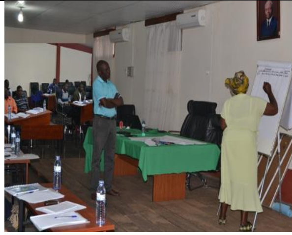
Training of agro-dealers in seed business & input provision