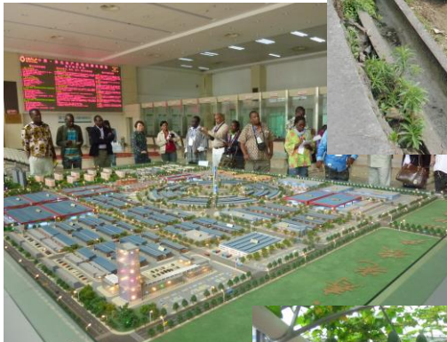
View of Agricultural Industrial Park of Shouguang group