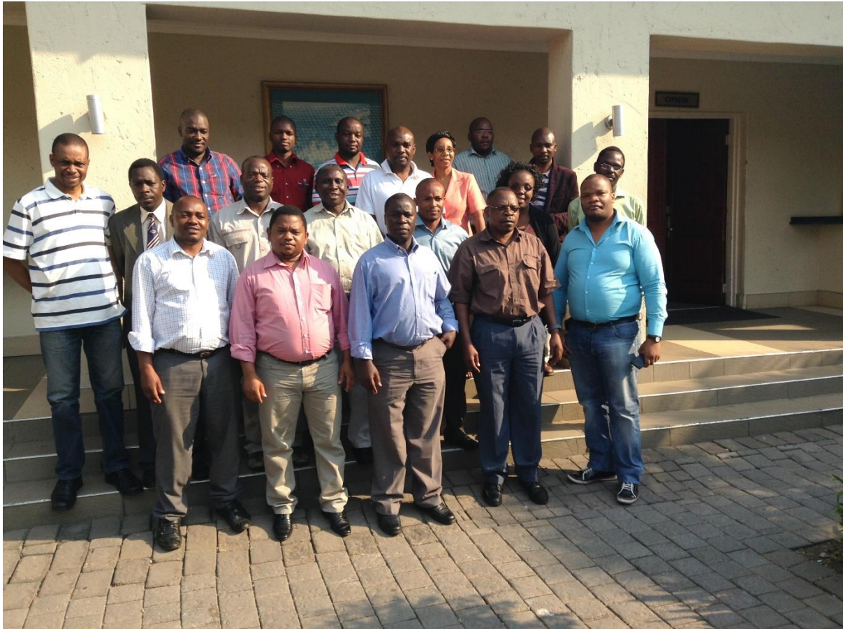
Figure 1 Group photo: APPSA M&E training workshop at Birchwood Hotel, Johannesburg, Sep 2014

Overall, the RCoLs have made some notable progress in implementation of activities under this component.