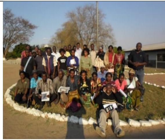
Farmer training in legume seed production at Likumbi Mukonchi, Central Province

The project on promoting the adoption of improved management practices for increased sorghum production in Zambia was also successfully implemented. Four improved agronomic practices (use of fertilizer, minimum tillage, herbicide and crop rotation) and two improved varieties (ZSV 36 R, and Kuyuma) were promoted through 3 demonstrations in Rufunsa and Kabwe. Although the yields were generally low, the demonstrations showed that using fertilizer and controlling weeds through use of herbicides has the greatest potential of improving sorghum yields. Thirty three farmers (20 male; 13 female) attended field days where the sorghum production guide was also distributed. Farmers appreciated the use of herbicides in reducing labour for weeding. Sorghum was also exhibited at four fairs