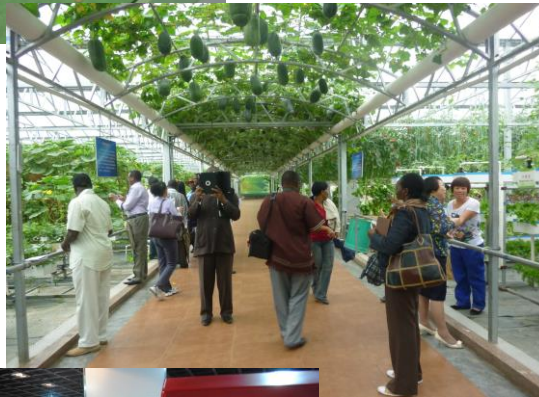
Vegetable Demonstration Garden at Shouguang