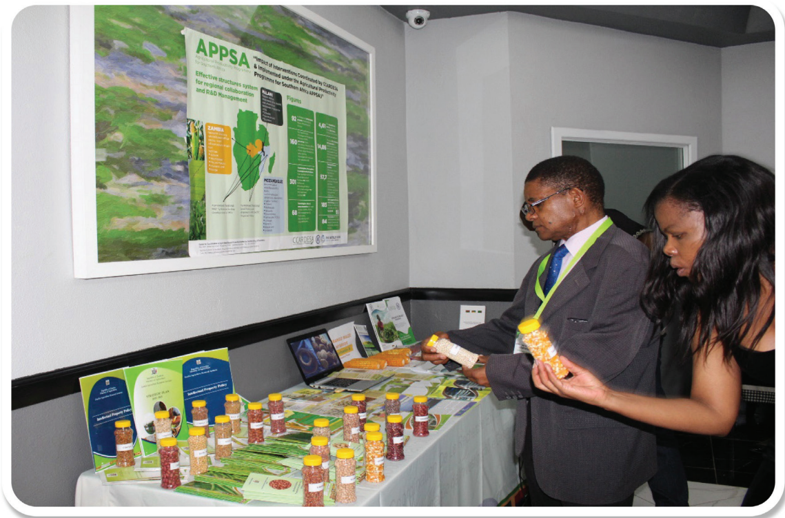
Display of key outputs from the APPSA RCoL