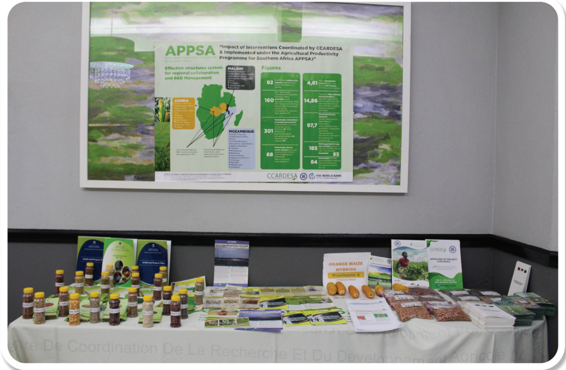
Display of key outputs from the APPSA RCoL