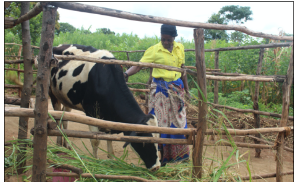
Black posing with her cow as it feeds

After experiencing the benefits of the fund, through fertilizers and dairy cows bought with the money they received, cluster members unanimously utter that the significance of VCF in hunger and poverty reduction is too big to be ignored.