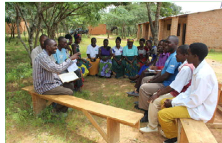
Natumumbwa Farmer Group holding a meeting