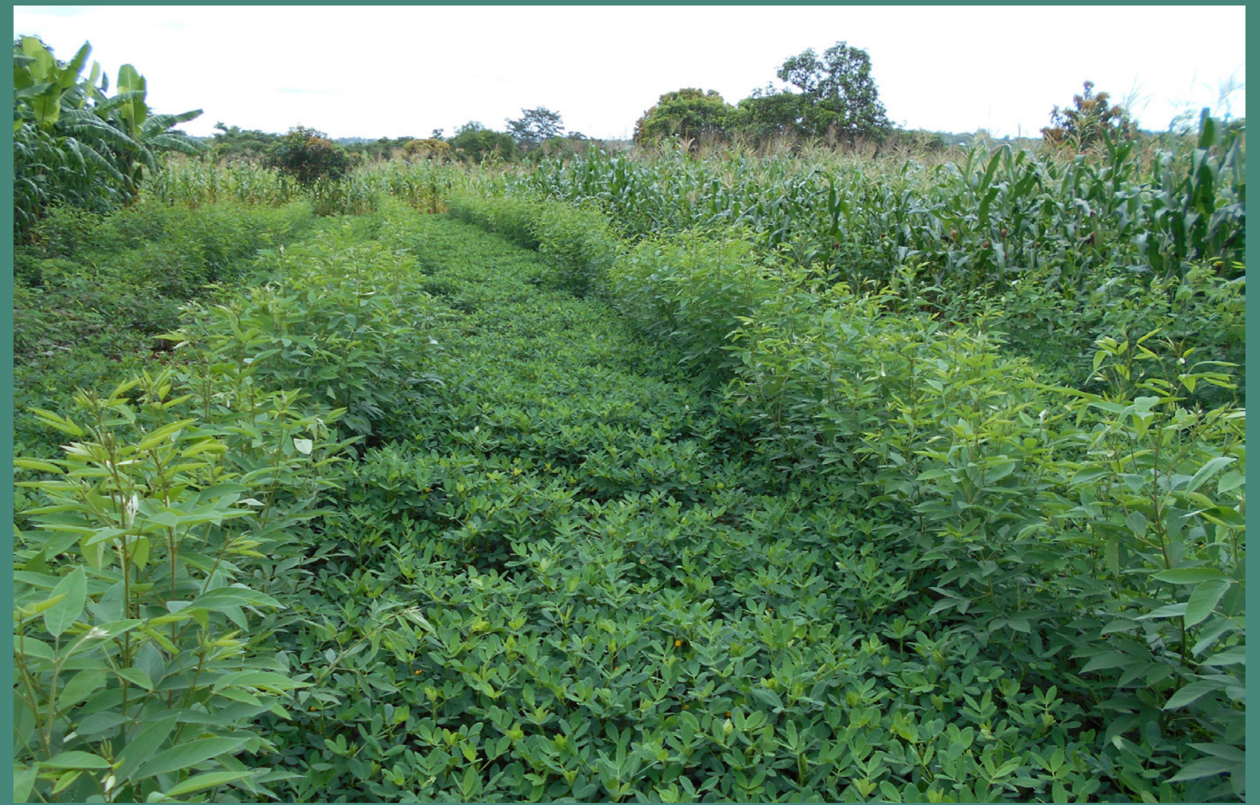
Groundnut-pigeonpea alley cropping under conservation agriculture in Lemu, southern Malawi