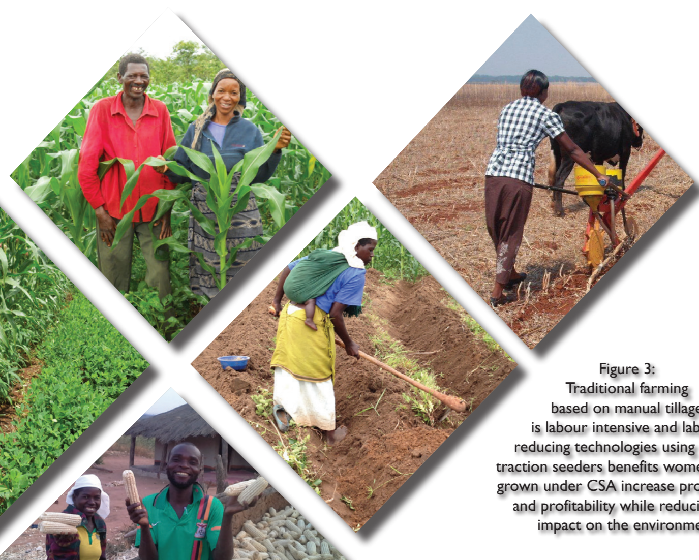
Figure 3: Traditional farming based on manual tillage is labour intensive and labour reducing technologies using animal traction seeders benefits women. Crops grown under CSA increase productivity and profitability while reducing the impact on the environment